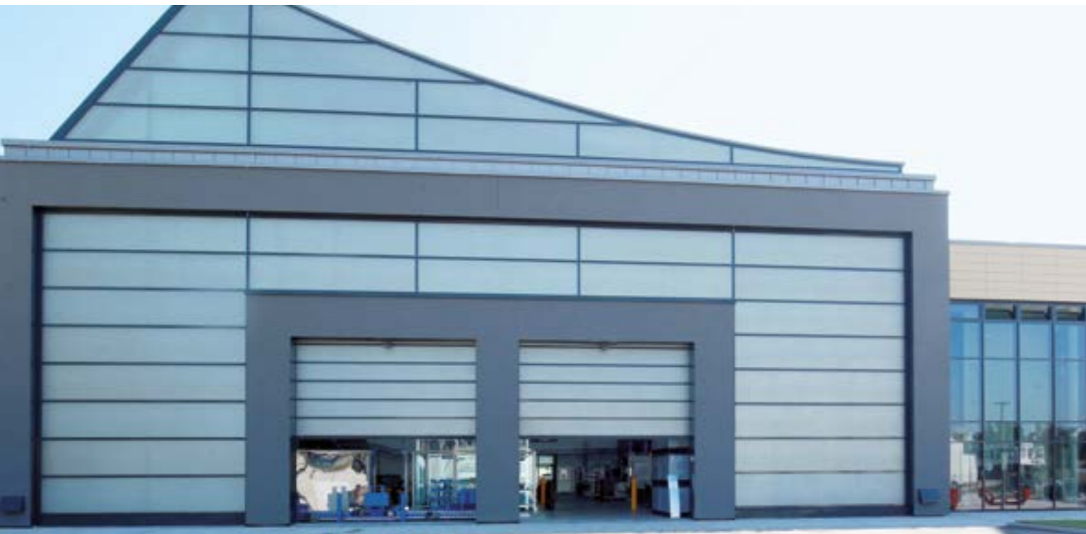
Door and facade of translucent fibreglass create impressive design and ergonomic aspects.